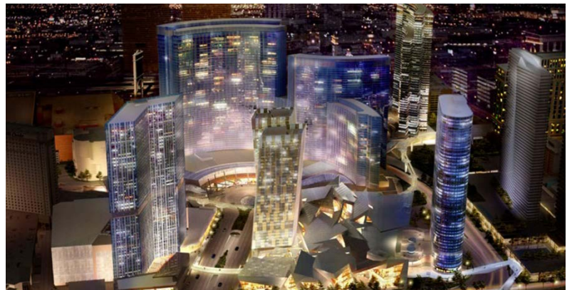
City Center – Las Vegas, NV Client: Beck Steel, Inc. – Design of more than 300 stairs and misc. structures for the Aria Resort & Casino and the Mandarin Oriental Hotel & Casino portions of the complex within a very tight delivery schedule.