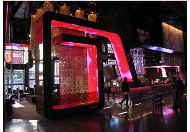
Cosmopolitan Hotel & Casino – Las Vegas, NV Client: KHS&S Inc. – Structural design for highly themed Northeast Corner Bar and Feature Bar. Developed numerous creative details that resulted in large savings for the Contractor and Owner.

“...INNOVA is a firm that represents Integrity, Fairness and Knowledge in the structural arena.”