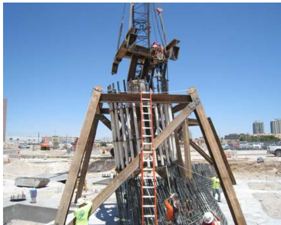
High Roller at LINQ – Las Vegas, NV Client: New-Com/MMC – Developed specialized rigging and structures to support the anchor bolt assemblies. We worked with our client's existing material stocks to save them money.