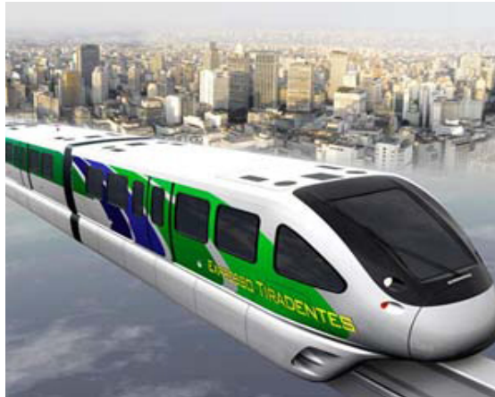
Espresso Tiradentes – Sao Paulo, Brazil Client: Consórcio Expresso Monotrilho Leste (CEML) – Support on alignment work, switch layout, form procurement, and the structural engineering for columns, beams, stations, etc.